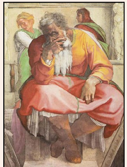
The Prophet Jeremiah By Michelangelo Sistine Chapel