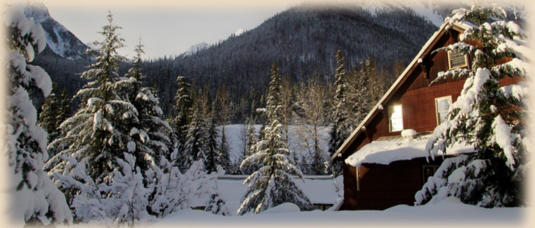
Holden Village, Washington

All candles may be extinguished after worship is concluded, signifying that our loving God has heard our prayers.